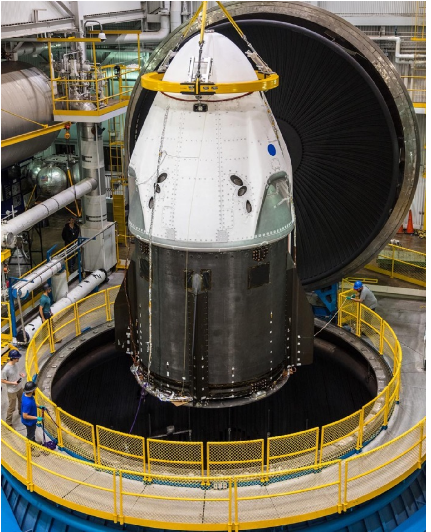
China Mobile Downgraded By Morgan Stanley. 'scrambling' To Catch Up On IoT. Say Reports